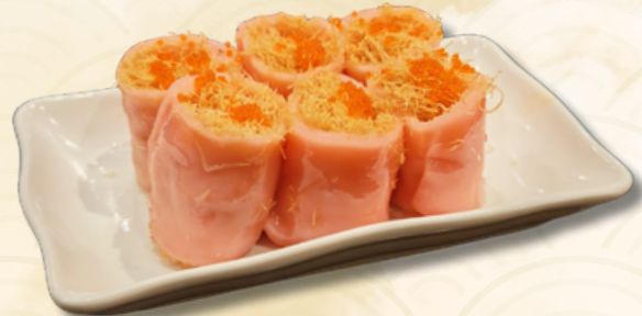
D282 龙须卷胀粉 £7.80 CRISPY DRAGON ROLL CHEUNG FUN (CONTAINS PRAWN)