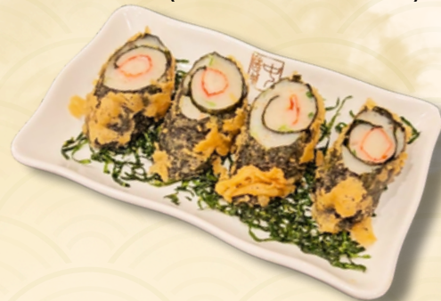
D96 紫菜蟠龙卷 £6.50 SEAWEED SWIRL DRAGON ROLL (CONTAINS SEAFOOD)