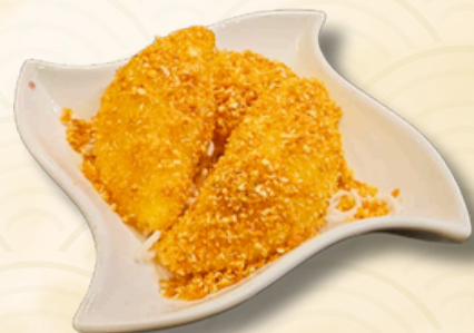
D283. 金沙炸粉果 £6.80 GOLDEN DEEP-FRIED SEAFOOD DUMPLINGS (CONTAINS PRAWN)