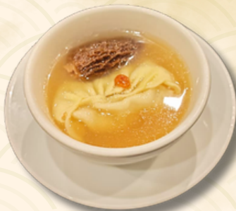
D281. 杞子羊肚菌汤饺 £5.80 MOREL MUSHROOM, SEAFOOD SOUP DUMPLING (CONTAINS PRAWN, CRAB, ROAST DUCK AND PORK)